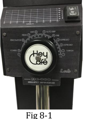
Fig 8-1 Finest position