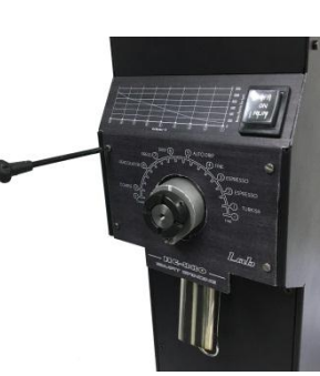
Step 2 – remove front cover step