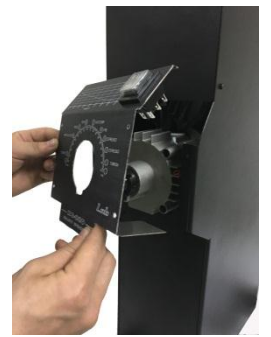
Step 3-mark and disconnect wires