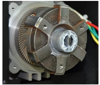
Step 8 -remove the shear key