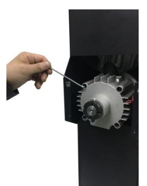
Step 5 – release grinding house