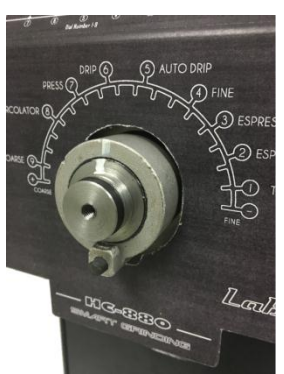
Step 4 note internal knob position