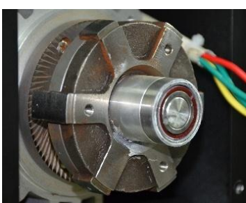
Step 7 –remove the bearing cover