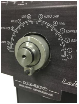
Fig 8-3 silicone and body markers