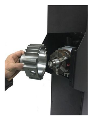
Step 6 -remove grinding house