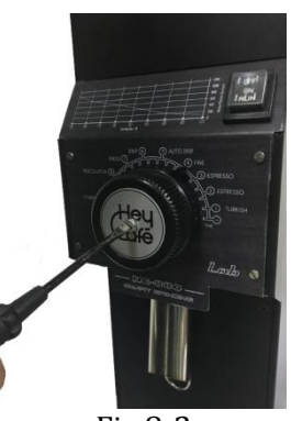
Fig 8-2 loosen the securing screws